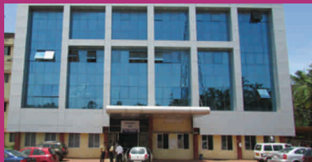
Srinivas Institute of Medical Sciences