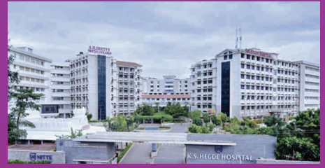
KS Hegde Medical Academy