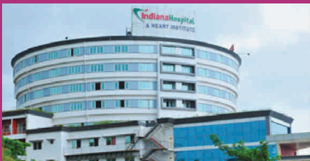
Indiana Hospital & Heart Institute