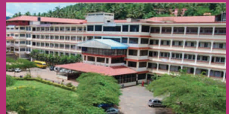
K.V.G. Medical College