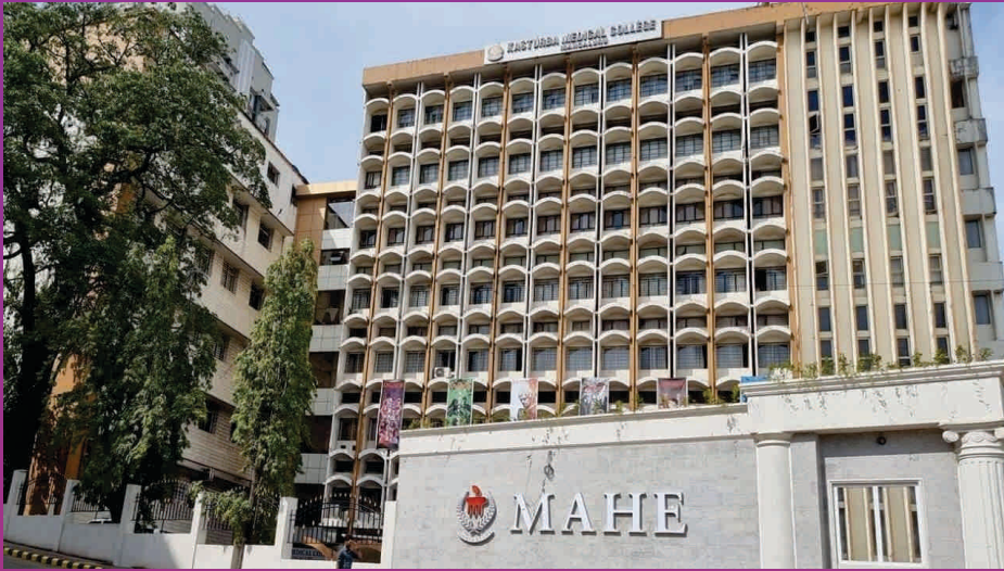
Kasturba Medical College, Mangalore