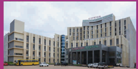
Kanachur Institute of Medical Sciences