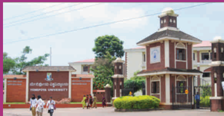
Yenepoya Medical College