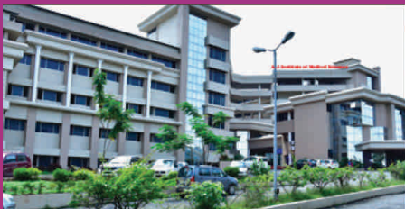
AJ Institute of Medical Sciences