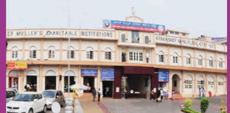
Father Muller Medical College